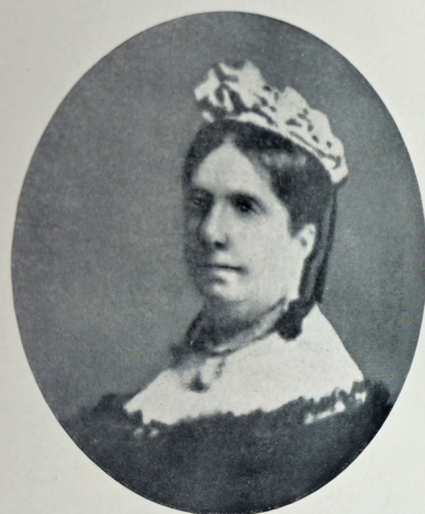
ISABELLA II. 1830-1904.

WITH ILLUSTRATIONS OF THE STAMPS DESCRIBED, FIFTY-ONE SHEETS OF PHOTO-MEZZOTYPE OR PHOTOGRAPHIC ILLUSTRATIONS AND ONE SHEET OF COLOURED AUTOTYPE ILLUSTRATIONS.