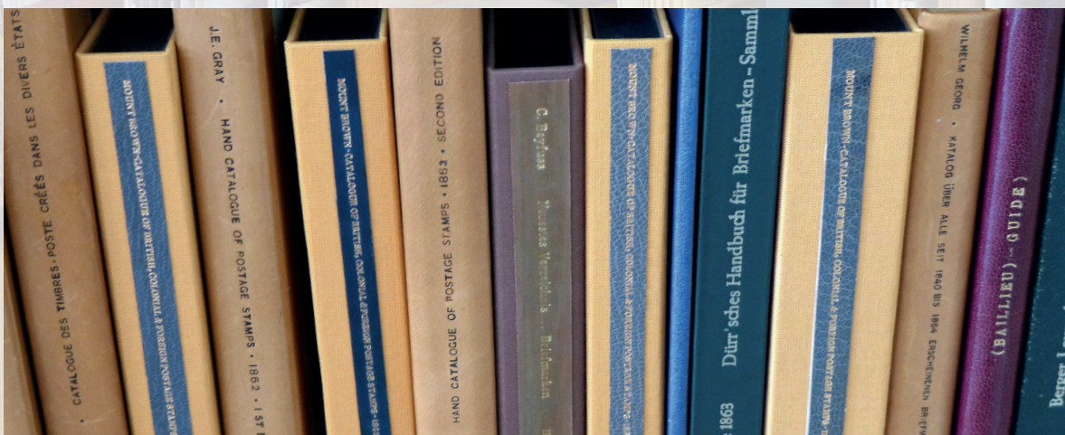
A selection of the bibliophile titles in the library, all preserved in a bibliophilic order.

Now, following a life long collecting, one of the most important philatelic libraries will be offered for sale. The 'PARIS' Library of Philatelic Literature, by Tomas Bjäringer RDP Hon FRPSL. The renowned Swedish philatelist and bibliophile spent decades collecting rare literature from around the world. Not only rarities, but also well-known standard works, each of which has something special, often even unique, about it.